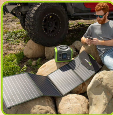
Compatible with Most Power Stations