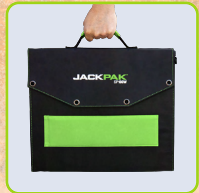
Flexible and Foldable Carrier