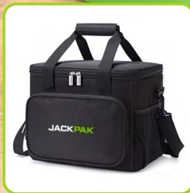
Cushioned Storage and Carrying Case