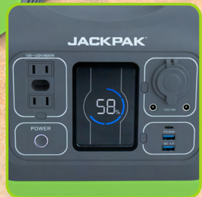
Multiple Power Outlets